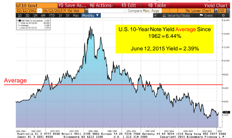
Review period February 12, 1962 – June 12, 2015. Past performance is not indicative nor a guarantee of future results.

Is the downtrend in yields since 1981 reversing towards average levels?